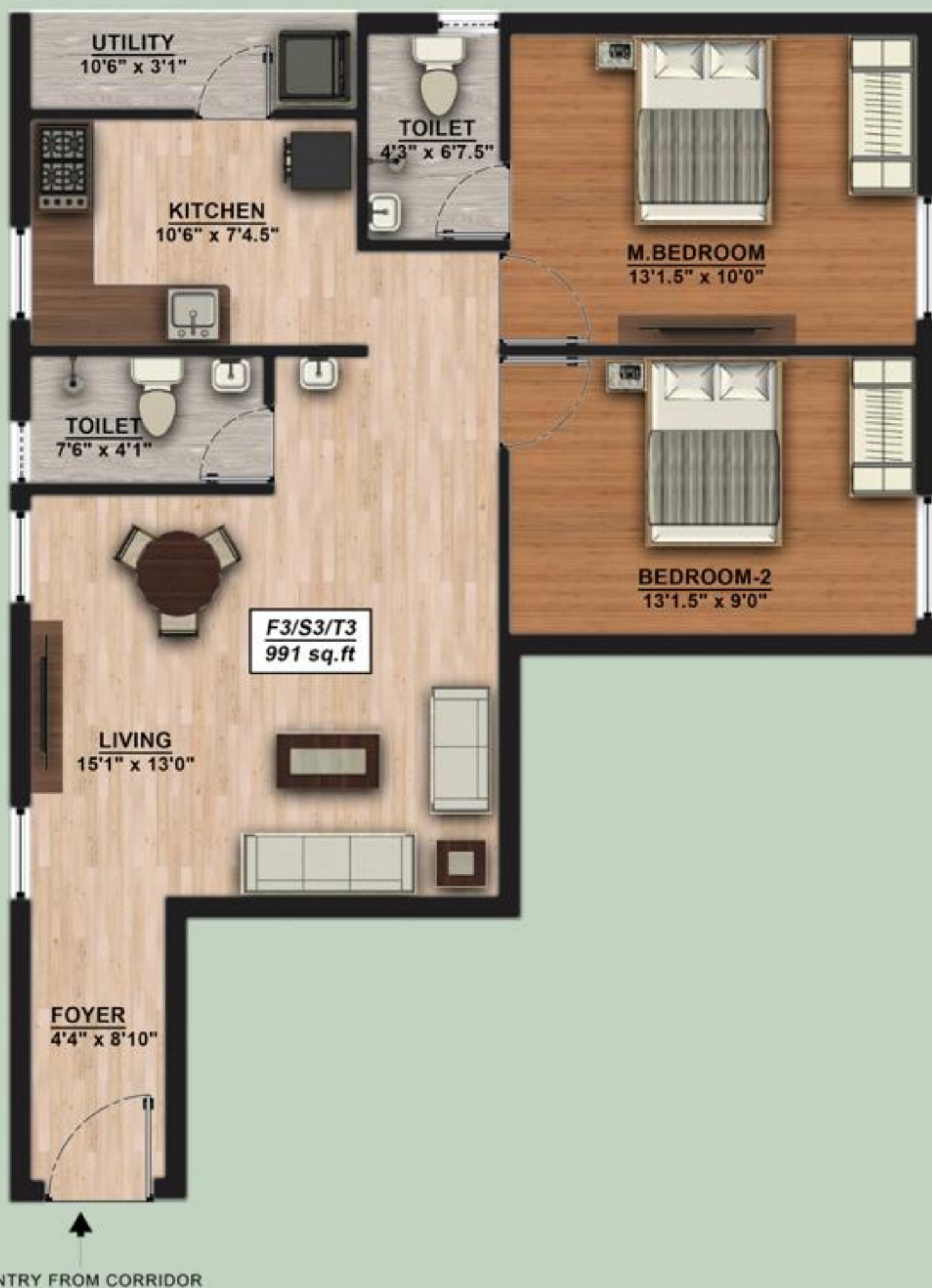
TYPICAL UNIT FLOOR PLAN - F3/S3/T3