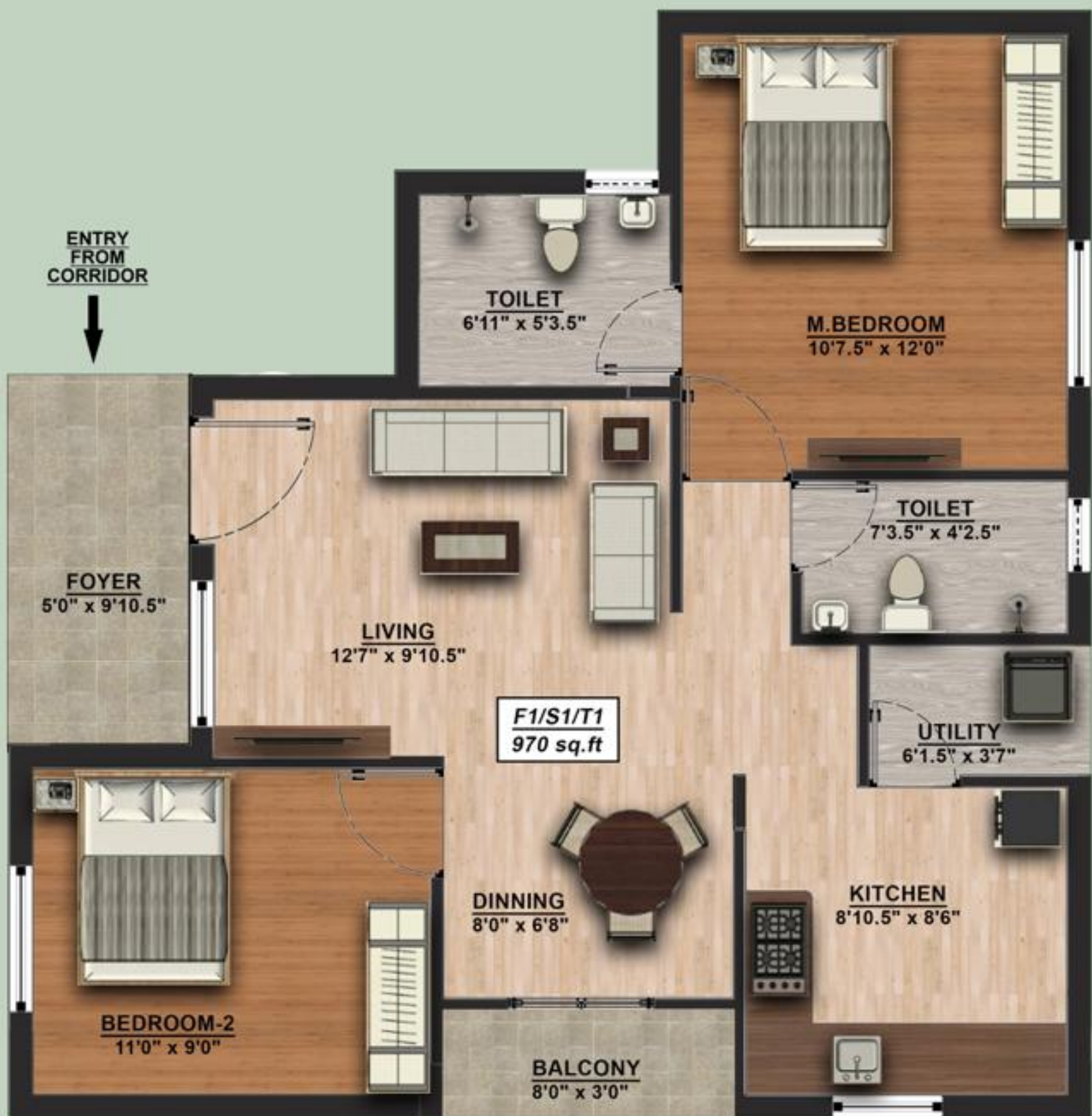
TYPICAL UNIT FLOOR PLAN - F1/S1/T1