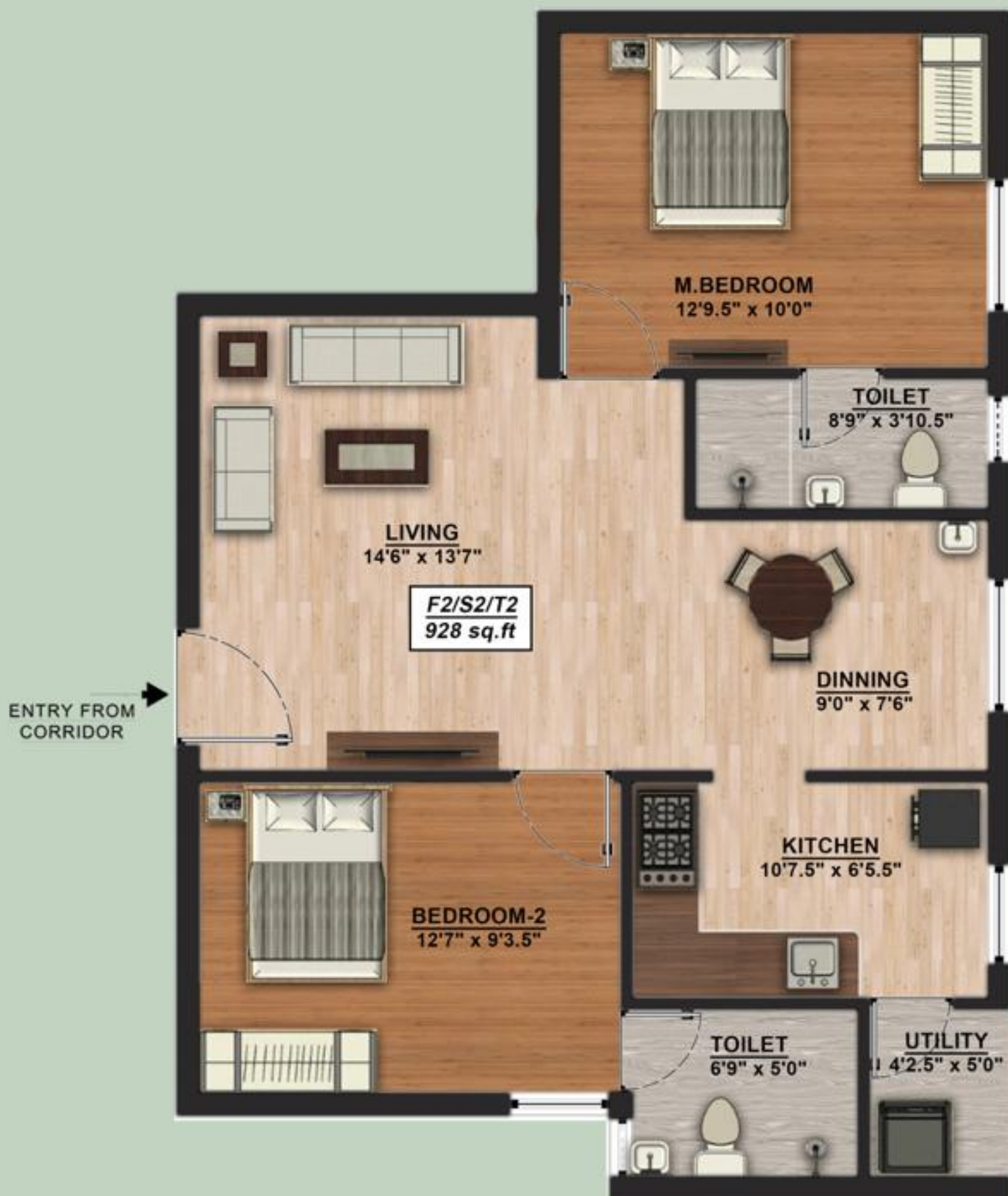
TYPICAL UNIT FLOOR PLAN - F2/S2/T2