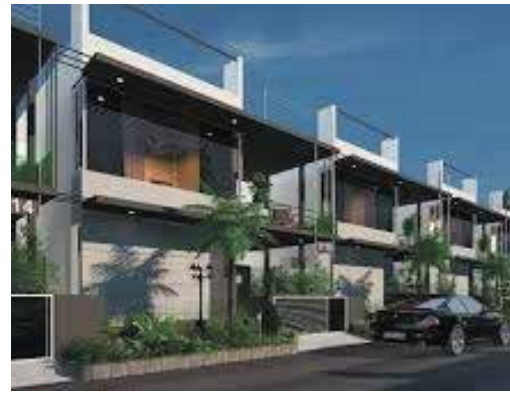
Kannur - Bengaluru