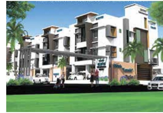
Medavakkam - chennai