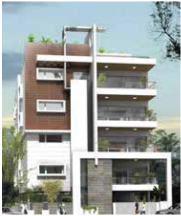
HBR - Bengaluru