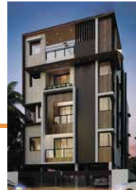
Virugambakkam - Chennai