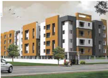
Mogappair - chennai