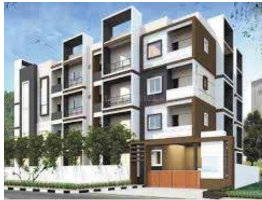
HBR - Bengaluru