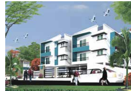
Pallavaram - chennai

ARCHITECTS: M/S URBANO ARCHITECTS Chennai & Bengaluru